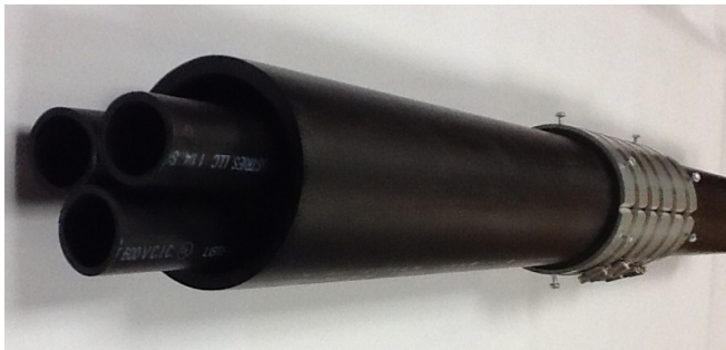
3N1™ COUPLER ON DUCT

To connect longer runs of 3N1™, Blue Diamond and ETCO Specialty Products have developed a coupling system that pressure-seals the innerducts and provides a positive water-tight connection for the outer casing pipe. The innerducts are connected using 6" wide, dense polyurethane elastomer ribbed interal compression fitting. The fitting can withstand 100 psi pressure, making it ideal for blowing fiber through the innerducts. The 3N1™ casing connector is 12" long rigid PVC case with a ribbed polyurethane insert. It opens as a clamshell to easily accomodate the HDPE casing in the field. Five marine grade stainless steel clamps compress the polyurethane liner making the entire connection water-tight. Stainless steel screws will provide 1000 lb tensile pull strength if required.