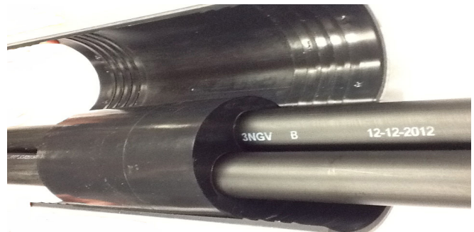
OPEN FITTING WITH POLYURETHANE INSERT AND INNERDUCT